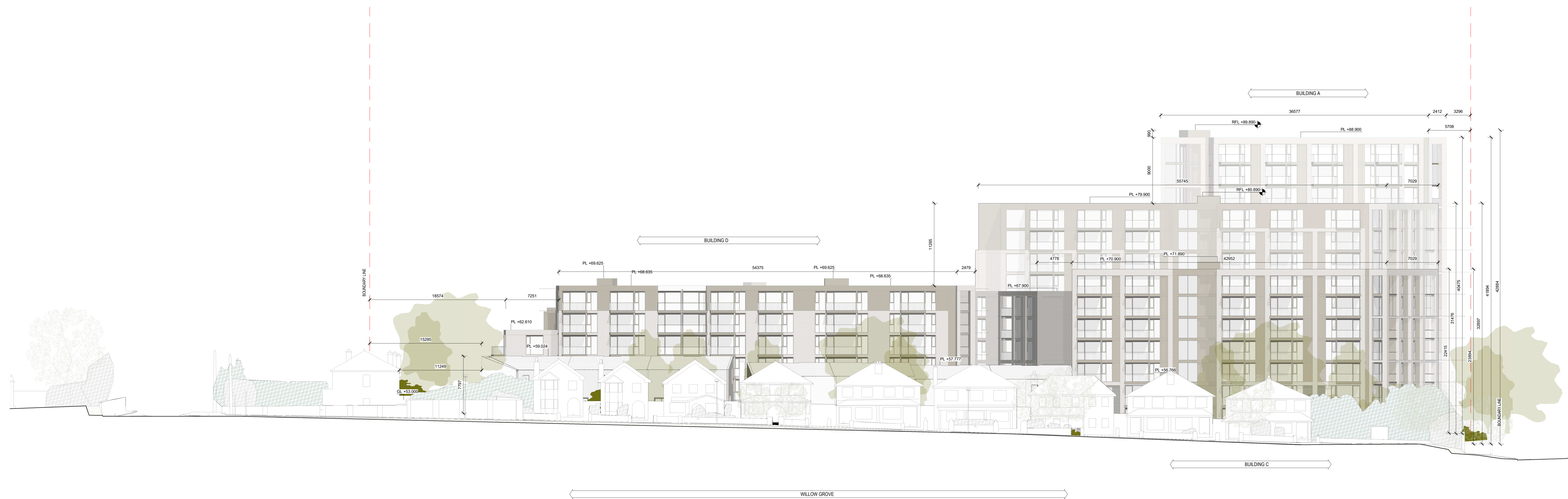
1 CONTIGUOUS ELEVATION - EAST 1 : 200